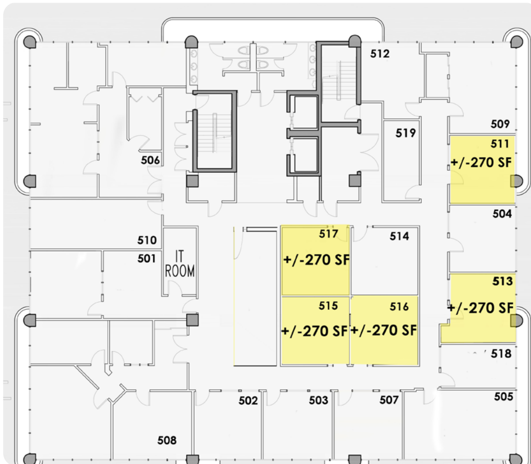
5TH FLOOR PLAN

Owned and Operated By A GATOR Affiliated Company